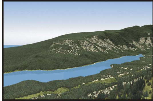
Non-Option Trial 90% Reduction (Demonstration Only)